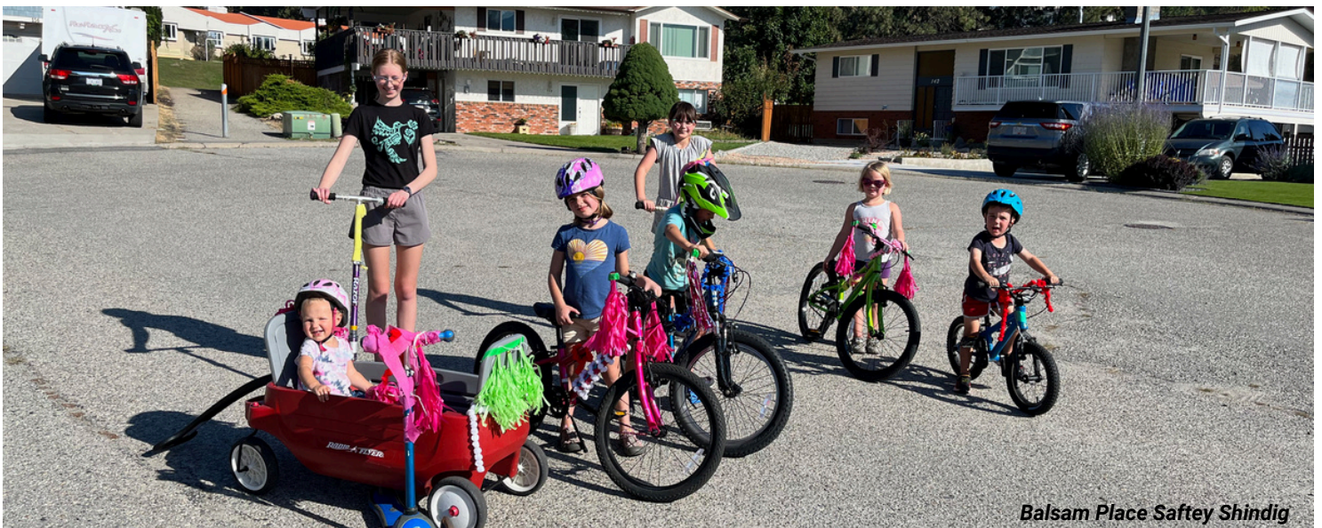
Balsam Place Safety Shindig

The Neighbourhood Small Grants program is grateful to learn and learn on the sacred and unceded homelands of the snpintktn and syilx peoples.